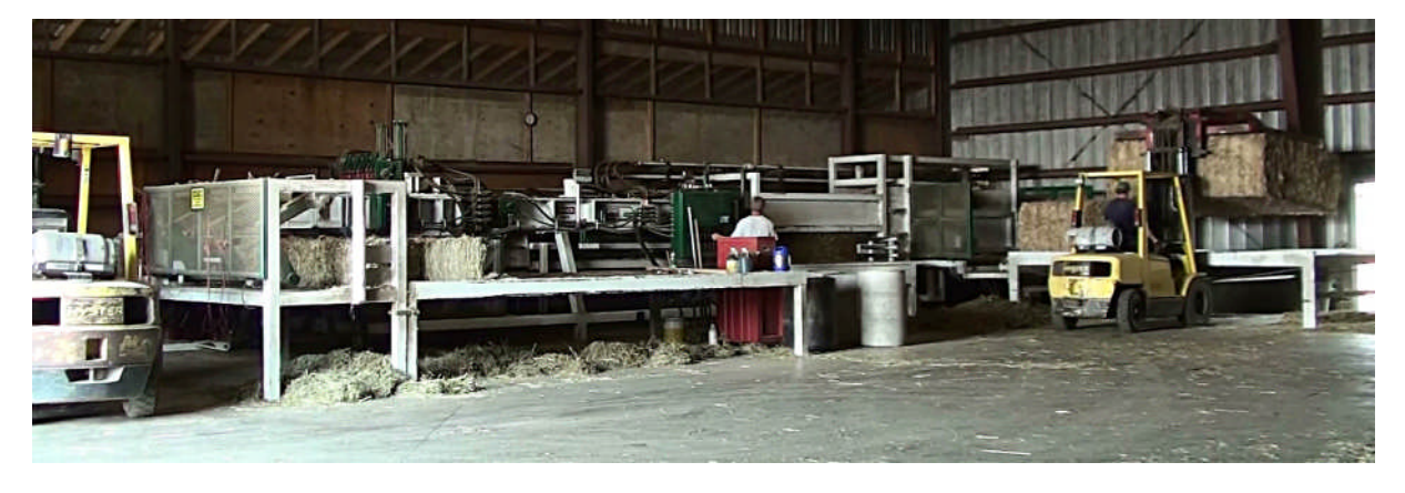
Figure 4 Commercial large square bale compressor (Heidel Hollow Farm, Germansville, PA)