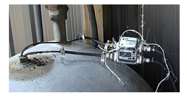
Figure 5 Flow meters and fuel tank providing fuel to compressor engine

with a flow meter, which were sized by consulting with the engine manufacturer. The fuel flow rate and time were recorded for each bale by taking readings from each on the flow meters.