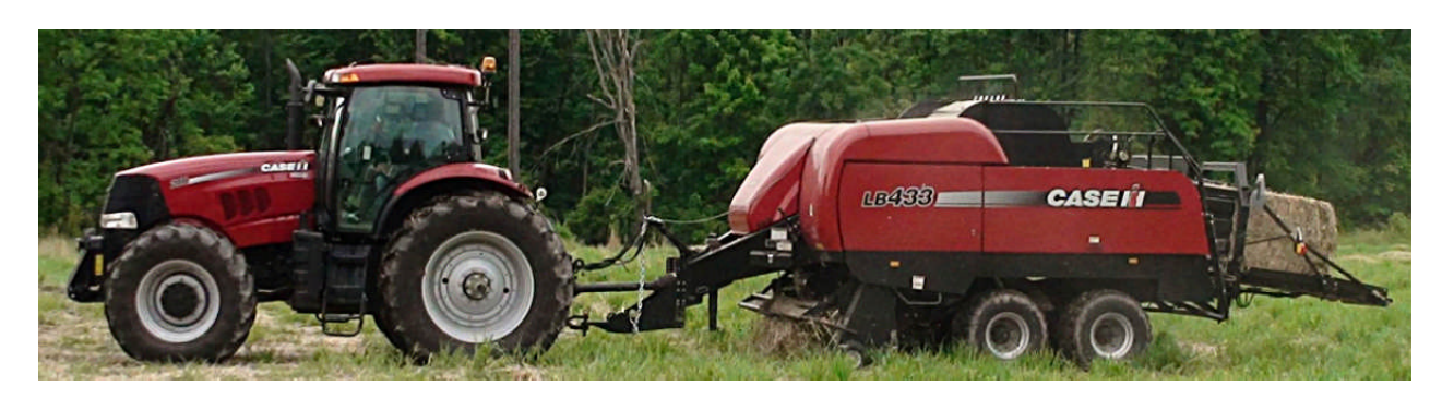
Figure 2 CaseIH LB433 square baler and CaseIH 210 Puma tractor