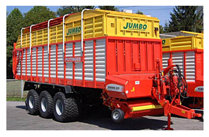
Note: It is used in loose material collection and driven by the Puma 210 tractor Figure 3 The self-loading wagon (Pöttinger Jumbo 8000)

Two fields were used to test a self-loading forage wagon (Figure 3). Field 1 had a distance of 4 km to a storage location where the machine dumped the harvested materials. Materials harvested in field 2 were dumped in a plot right beside this field referred to as in-field unloading. Switchgrass bales were stored to be converted into briquettes on farm or saved for bale compression tests. All fields to be harvested were mowed in advance. The material was allowed to dry to adequate moisture content before raking or merging of the windrows. The switchgrass had less than 15% (d.b.) moisture by the time of harvesting.