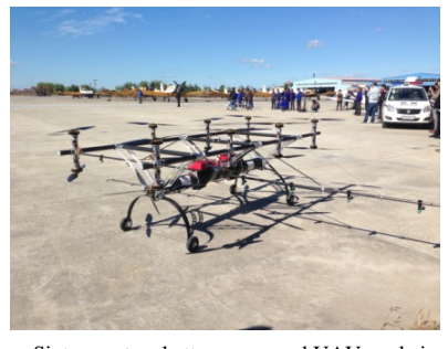
c. Sixteen rotors battery-powered UAV made in China with 30 L chemical liquid-tank (3WYR-30)

Figure 1 Single- and multi-rotor UAVs for plant protection in China