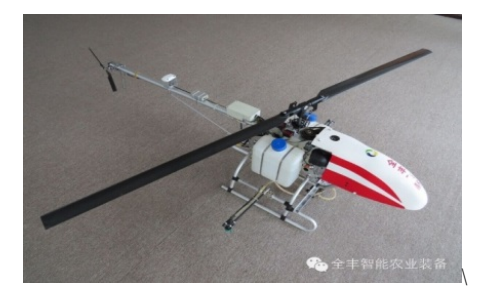
a. 3WQF80-10 (Quanfeng, Anyang)

eight-rotors battery power UAV were tested using this method in 1 hm<sup>2</sup> wheat field and the effects of flight direction, flight parameters and crosswind on the distribution of spatial spraying deposition quality balance and the downwash flow field distribution were researched. The test results showed that regardless of the flight direction and height and the crosswind, all these factors influenced the droplets deposition distribution via weakening the intensity of the downwash airflow field in the direction perpendicular to the ground.