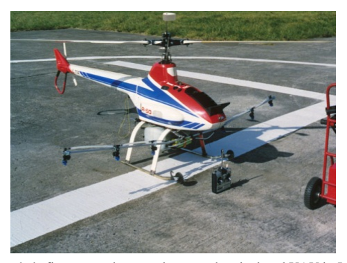
a. Yamaha's first generation petrol-powered agricultural UAV in Japan: Model 'R50'

Along with the continuous development of agricultural aircraft, Japanese aerial spraying technology made considerable progress. The volume of the tank increased from 5 L to 24 L, and the application rate developed from the original application rate of 30 L/hm<sup>2</sup> to a lower application volume of 5 L/hm<sup>2</sup> and finally to an ultra-low volume spraying of less than 1 L/hm<sup>2</sup>. Ultra-low volume technology has been well developed in The Yamaha's newest model 'R-Max 3880' Japan. invented in 2010 has equipped with two tanks of 12 L each mounted on the both sides of the fuselage, and the time required to fill two tanks is less than 1 min with simple operations of launching, controlling and spraying as shown in Figure 3b.