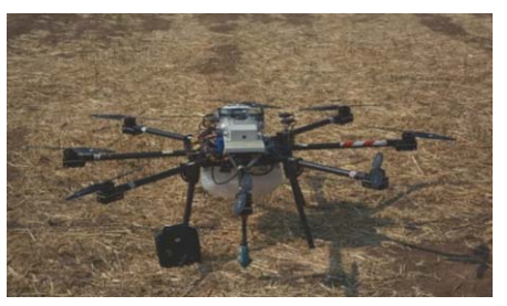
c. LHX8-3WD10 (Look Heed, Wuhan) Figure 6 Three test UAV types of SSDQB system