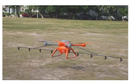
b. CG-Q60S (Crop Guard, Zhuhai)