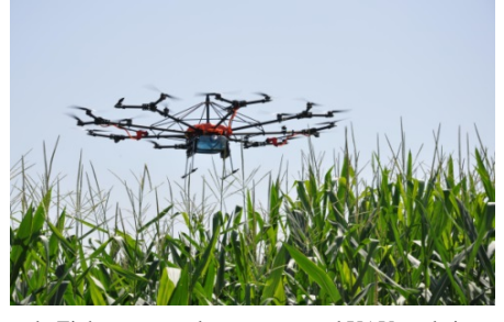
b. Eighteen rotors battery-powered UAV made in China with 15 L chemical liquid-tank (3WSZ-15)