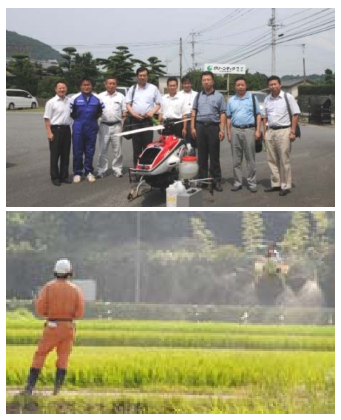
a. Project field trails using YAMAHA 1880 UAV in Japan in 2012

Ministry of agriculture of the People's Republic of China organized a two-year UAV International Co-operation Project "UAV chemical application technique for rice" among China, Japan and South Korea during 2012 to 2013. CCAT was in charge of Chinese side, experiments were taken in different time in three countries and all members of the project shared all information and technology of UAV together.