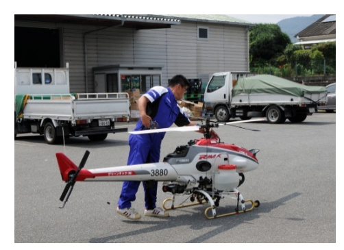
b. Newest model 'R-Max 3880' in the process of launching in Japan in 2015 Figure 3 Yamaha's agricultural UAVs

Nowadays, Japanese research of aerial spray and control technology gives priority to the following two aspects: (1) Building droplet distribution simulation mathematical model of aerial spraying and analyzing the effect of different altitudes, wind speeds and types of aircrafts on droplet size and droplet drift. Another technology in use is controllable droplet technology, that pilot choose the corresponding nozzle and spraying parameters to control the droplet classification, size and