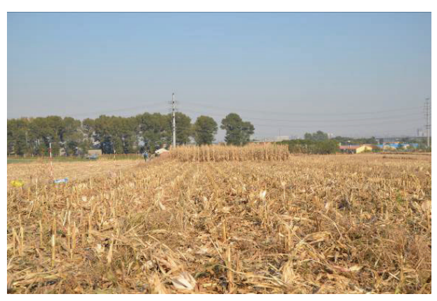
Figure 8 Operation effect